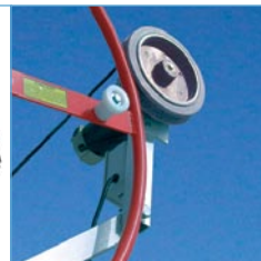
Wheel Assist Electric Motor Kit