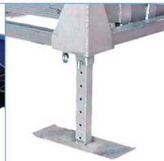
Longer Extension Legs