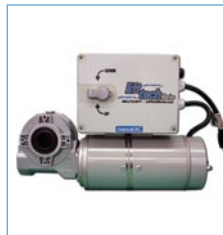
Direct Drive Electric Motor Kit